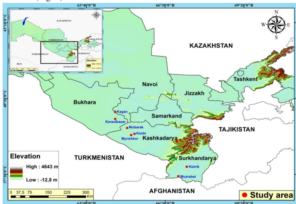
Fig. 1. Map of the geoinformation system of points for collecting amphibian samples

During the years 2024-2025, scientific materials were collected using directional and stationary research methods from various geographical areas of the southern and central regions of our Republic at the following coordinates: Kashkadarya region 39°0'51.73"N, 65°23'43.94"E 38°58'1.82"N, 65°16'29.85"E; 39°13'55.88"N, 65°7'54.75"E; Surxondaryo region 37°46'58.91"N, 67°16'49.60"E 37°25'46.65"N, 66°58'34.13"E; Bukhara region 39°49'55.48"N, 64°41'41.30"E; 39°34'2.03"N, 64°42'9.91"E (Fig. 1).