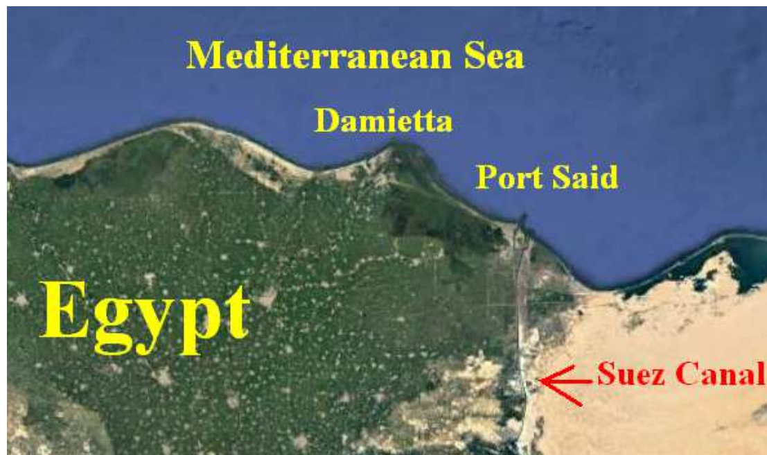
Fig.(1): A map of the Egyptian Mediterranean Coast showing the sampling sites: Port Said and Damietta.

Off Port Said at depth 15- 20 m (31° 22' 21.43" N, 32° 15' 35.84" E) and off Damietta at depth 50 m (31° 32' 64" N, 31° 53' 08" E), (Fig.1).