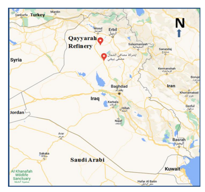
Fig. 1. A map of Iraq showing the Qayyarah refinery in Mosul City;(from Google earth).