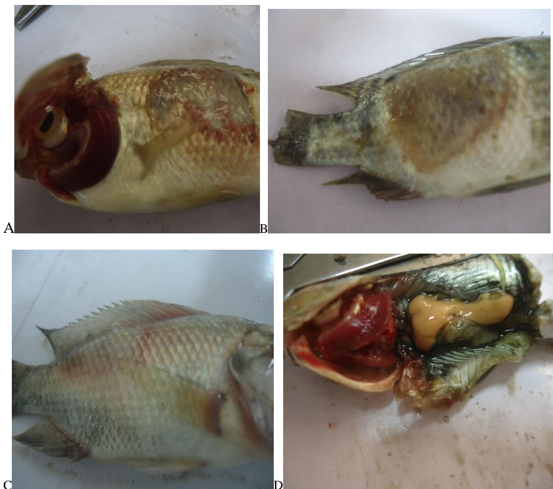
Fig. 1. Clinical symptoms of the Nile tilapia after infection with A. hydrophila displaying: (A) Exophthalmia; (B) Fin rot and swelling of tissues, and (C) Redness of skin (D) haemorrhage