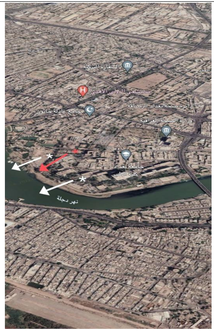
Fig. 1. A map showing the modeling site points from Tigris River near medical city hospital; discharge site