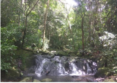
Fig. (5): Konnakkad