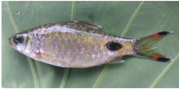
Fig. 16. Dawkinsia filamentosa