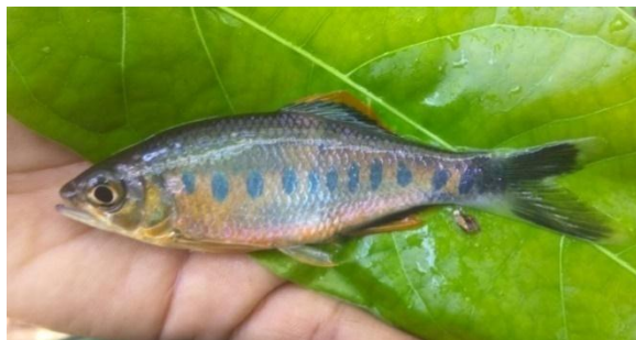
Fig. 11. Barilius ardens