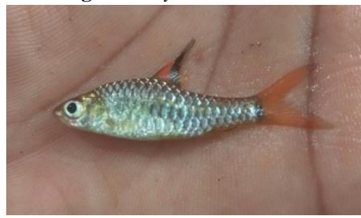
Fig. 26. Puntius vittatus