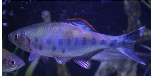
Fig. 14. Barilius malabaricus