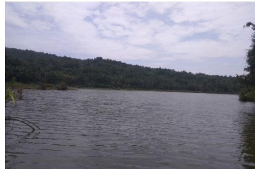
Fig. (2): Nileswaram