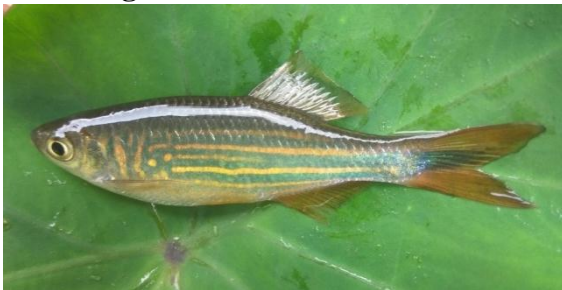
Fig. 17. Devario malabaricus