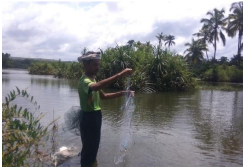
Fig. (1): Aarayipuzha