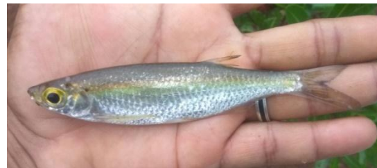
Fig. 28. Salmostoma boopis