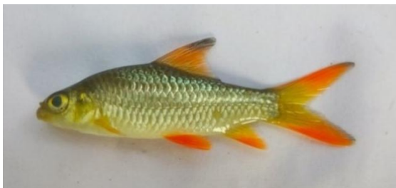
Fig. 21. Hypselobarbus nitidus