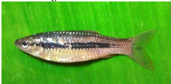
Fig. 27. Rasbora dandia