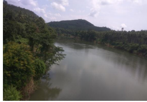
Fig. (6): Mukkada