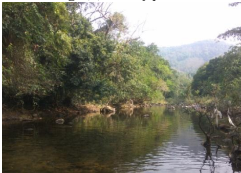
Fig. (9): Mallam