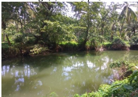
Fig. (3): Chayyoth