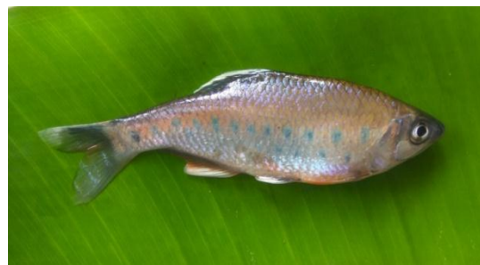
Fig. 12. Barilius canarensis