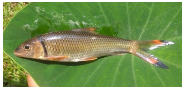
Fig. 20. Hypselobarbus curmuca