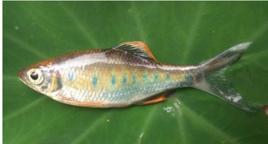
Fig. 13. Barilius cyanochlorus