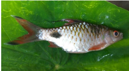
Fig. 15. Dawkinsia assimilis