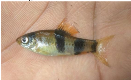
Fig. 19. Haludaria faciata