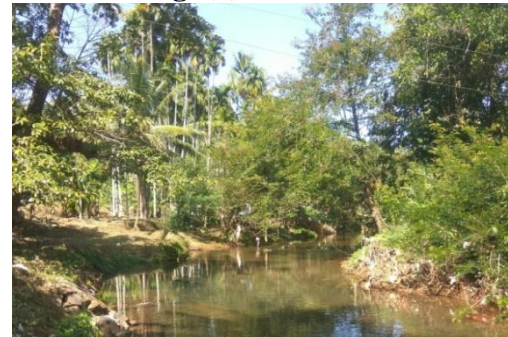
Fig. (10): Vellarikkundu