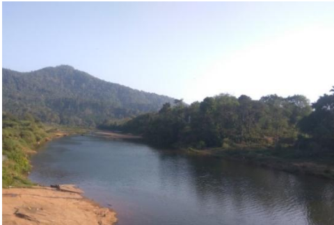
Fig. (7): Eranjipuzha