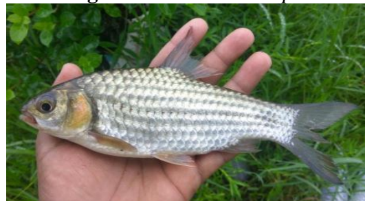
Fig. 30. Systomus subnasutus