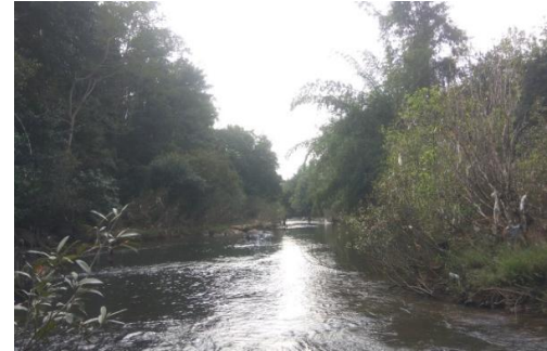
Fig. (8): Panathur