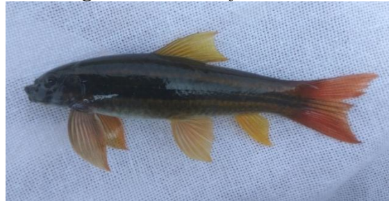
Fig. 18. Garra mullya