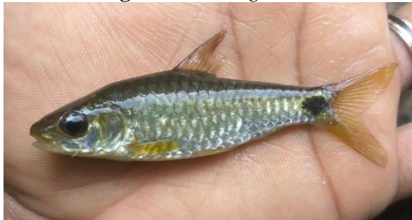
Fig. 25. Puntius ocellus