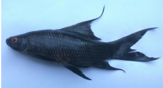
Fig. 23. Labeo nigrescens