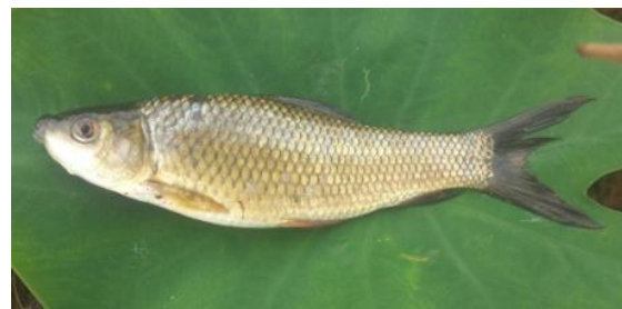
Fig. 22. Labeo rohita