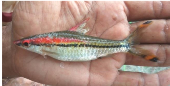
Fig. 24. Sahyadria denisonii