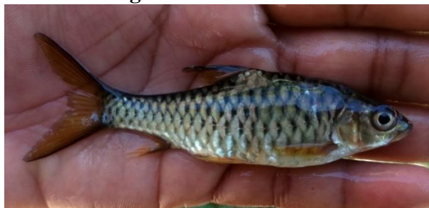
Fig. 29. Tor khudree