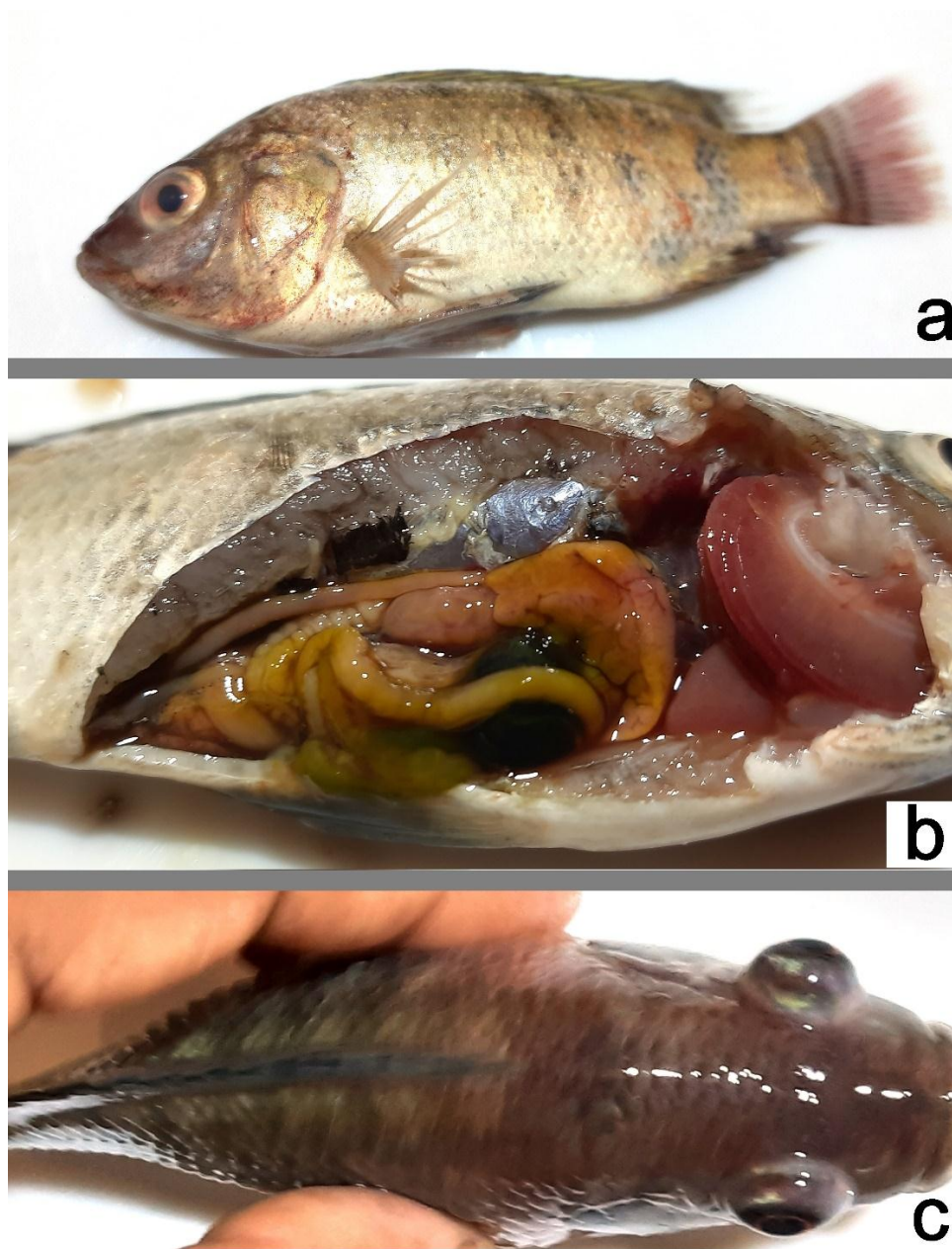
Fig. 1. Experimentally infected O. niloticus with Y. ruckeri a) Skin ulceration, petechial haemorrhage around the lower jaw, pectoral fin and tail erosions. b) Icteric liver and enlarged distended gall bladder. c) Bilateral exophthalmia.