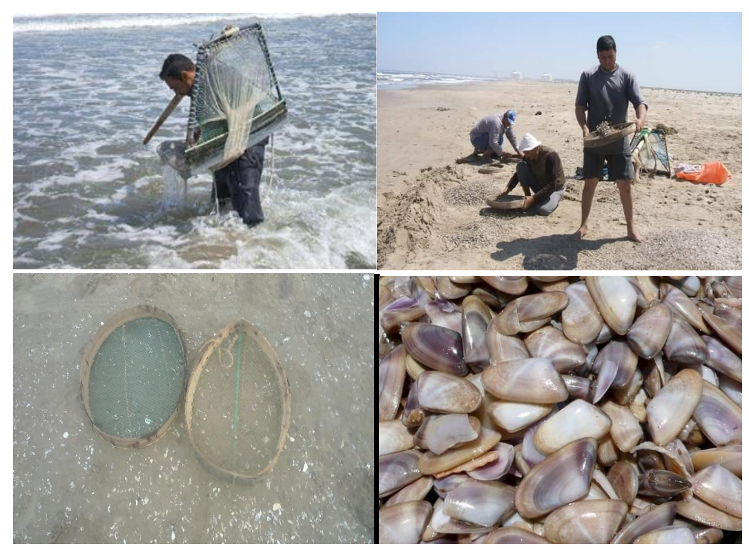
Fig. 3: Steps of collection and grading of the bivalve D. semistriatus

All the measurements were taken to the nearest 0.01 mm with a manual Vernier caliper. Each specimen was weighed using electric balance with a precision of 0.001 g (Total weight). The soft parts were removed, dried on paper towel and weighted (soft weight), then dried at 70 °C for overnight and weighted again (dry weight). Empty shell was also weighted (dry weight).