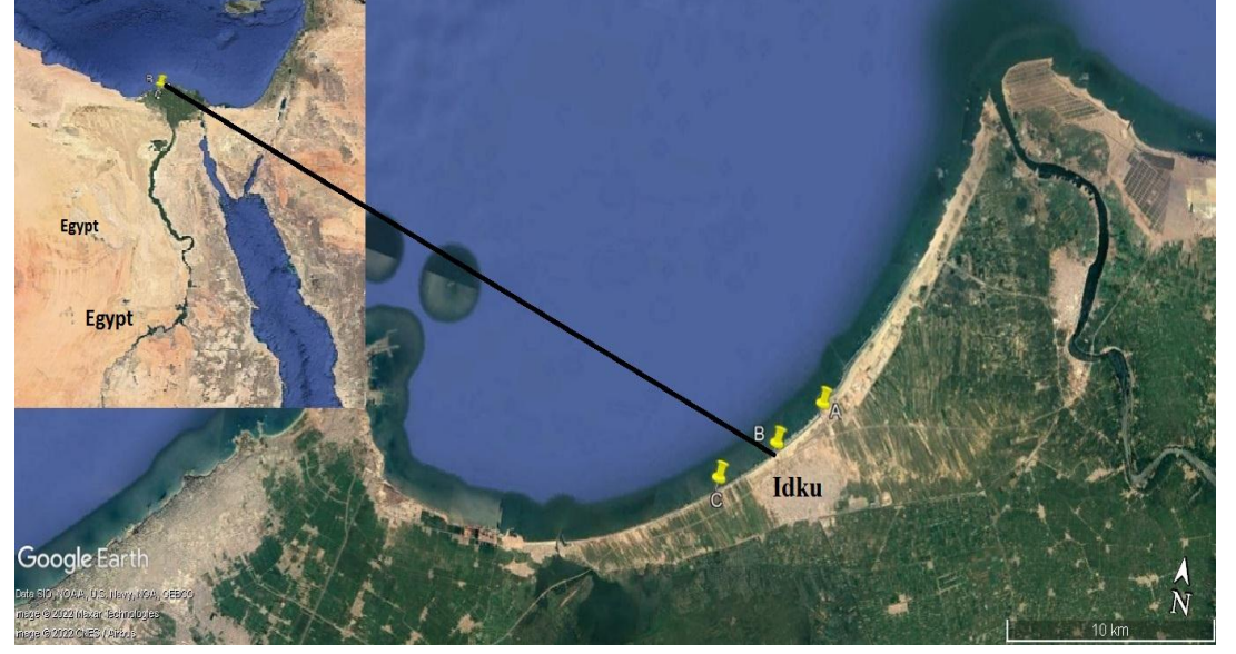
Fig. 1: Location of Idku city (northern Egypt) and the sampling sites.

see the differences in population structure, growth and maturity stages of the clams between the three sites. Site (A) is located near sources of pollution (harbor and petroleum Company) selected region site (B) located near Idku city, selected region site (C) located at waterway that discharges waste water (result from irrigation) into the sea.