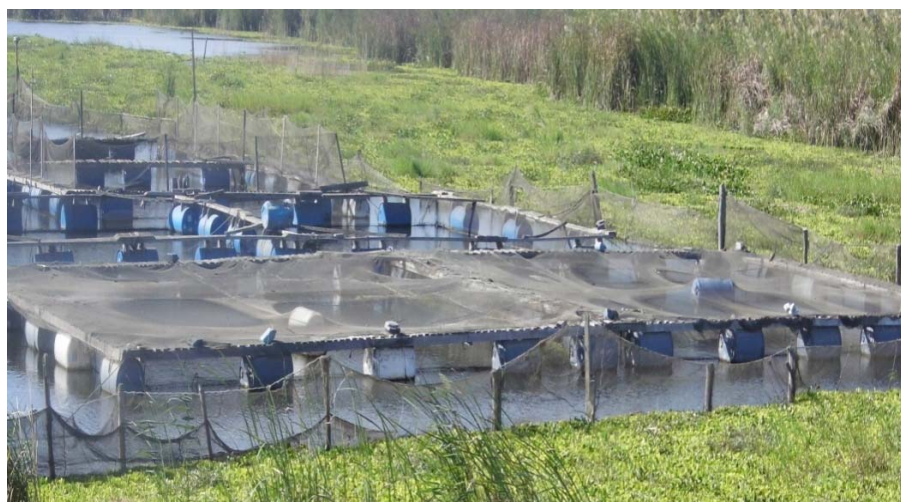
Fig. 1: Site of the experimental cages in Manzala Lake, Dakahlia Governorate, Egypt

All fish groups were fed on the same artificial pelleted diet (about 25% crude protein), which purchased from AboAbbas Animal Feed Factory, the industrial zone El-Asafra, Al-Matariah, Dakahlia Governorate, Egypt. The ingredients of the artificial diet and its chemical composition are illustrated in Table 2. The artificial diet was offered manually to the fish in all treatment twice daily at 9.00 a.m. and 15.00 p.m. The feeding rate was 4% for the three months of the experiment and decreased to 3% of body weight mass till the end of the experiment. The feed quantity was adjusted biweekly on the basis of the actual changes on biomass of the fish in each cage.