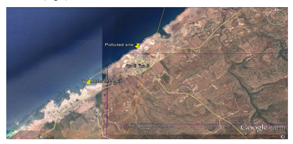
Fig. 1: Map of Al- Hanyaa, Libya on the Mediterranean Sea.

Two sites were chosen during this study. The first site, polluted, lies adjacent to a sewage outlet at 32°50'44"N and 21°31'12 E. The second one is a reference (unpolluted) site, lies at 32°50'5"N and 21°30'22 E and is far about 3Km westerly from the first site (Fig.1).