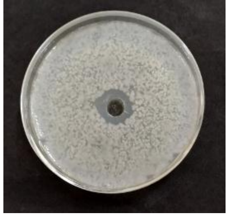
Fig.3. Zone of inhibition around the well with no bacterial growth

Wells are cut on pathogenic bacteria seeded solidified nutrient agar plates, and mucus is poured in the wells. After incubation of 24-36 h at 37°C, a clear zone of inhibition can be observed around the well. Zone of inhibition is the area on the agar plate where microbial growth does not occur (Fig. 3). The diameter of ZOI reflects the intensity of antibacterial activity of mucus.