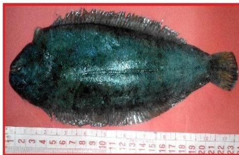
Figure 2. The sole fish, Solea solea , collected from Lake Qarun.

A total number of 80 fish (about 20 fish/season) were seasonally collected for freshly examined or preserved for later examination. In the laboratory, fishes were identified; the total and standard lengths of each fish ( Figure 2 ) were measured and recorded to the nearest centimeter (cm). While, the body weight was determined to the nearest gram (g). After dissection, a known weight of the muscles was kept under freezing condition at 4 °C until the latter examinations.