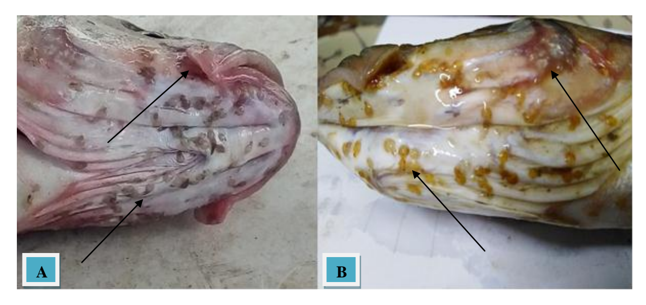
Plate (1): Naturally infected D. labrax showing a large number of sea lice ( Caligus minimus ) on head region with excessive mucus and hemorrhage at operculum cover.

The most common post-mortem lesions were congestion and hemorrhages of the internal organs with small grossly ascetic fluid in the abdominal cavity. In addition to, paleness of liver and kidney were observed in some cases and discoloration of liver with flabby skeletal muscles (Plate (2) D).