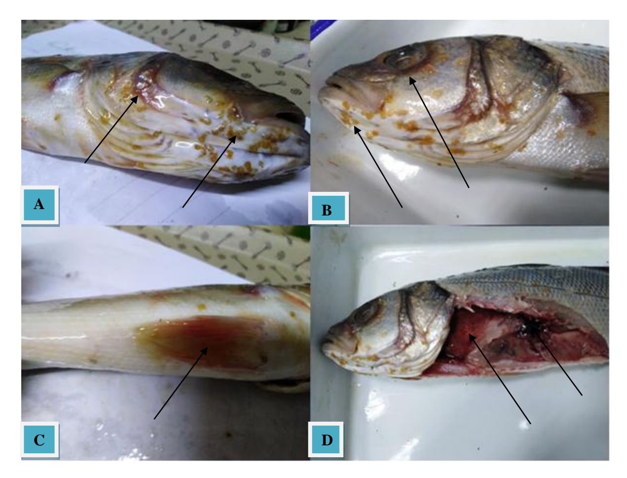
Plate (2): ( A) Naturally infected D. labrax showing a large number of sea lice all over the body especially on head region. (B) D. labrax showing corneal opacity. (C) showing focal hemorrhage at abdominal region especially at fins and (D) D. labrax showing discoloration of liver with small grossly ascetic fluid in the abdominal cavity.