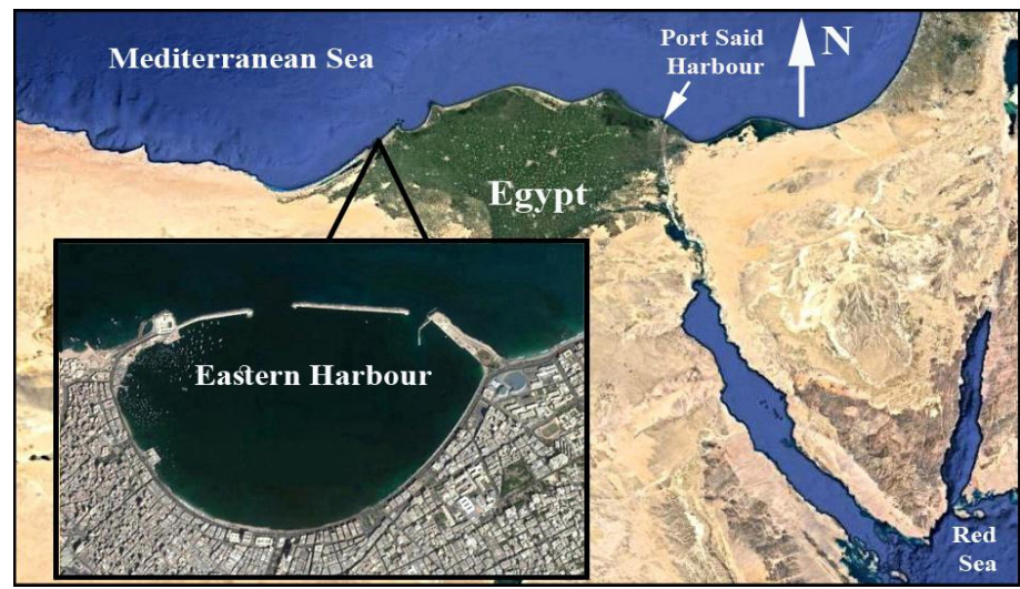
Fig. 1. A map of northern Egypt showing sampling stations off Alexandria City

Sea star samples were collected from the Eastern Harbor (29885 E longitude and 31205 N latitude) located at Alexandria, Egypt (Fig.1). The sample was collected manually, including the holdfast from the Scout club located in Eastern Harbor in the intertidal zone at the depth of (5-100 m). The fresh samples were washed with seawater at the sampling site to remove the adhered sediments and impurities, and then put in polyethylene bags. Quick rinsing of the sea star with tap water was done in the laboratory on the same day to neglect any remaining impurities or epiphytes.