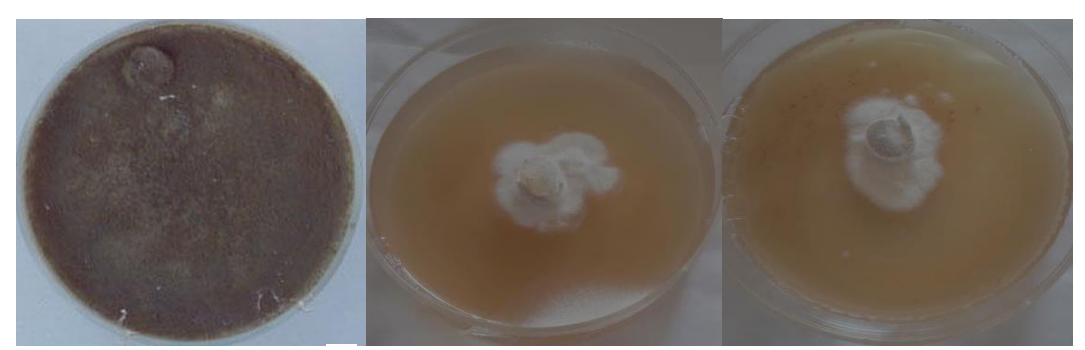
Fig. 3. Antifungal activity of A. spinulosus crude extracts via pouring method against P. crustosum; control (Left), treated by acetone extract (Middle), and treated by ethanol extract (Right).

*AU refers to the antibacterial activity which was calculated according to the equation mentioned in methodology section. NI means inhibition was not happened. A= acetone, E= ethanol, EA= ethyl acetate, and M= methanol.