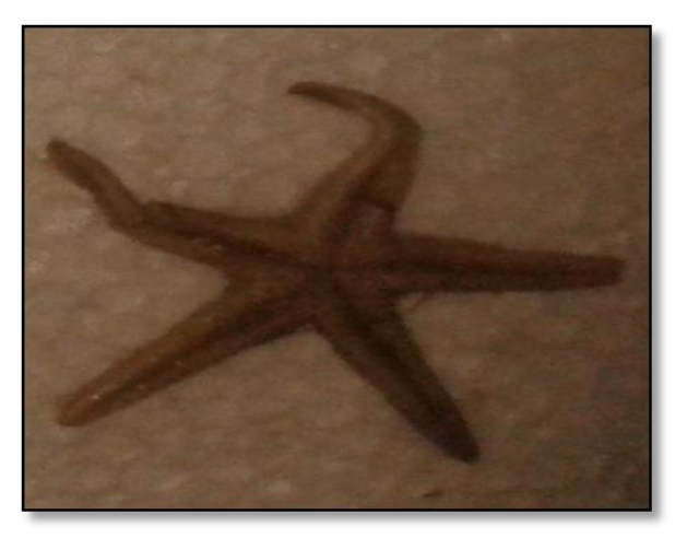
Fig. 2. General external feature of A. spinulosus sample collected from the Mediterranean Sea, Alexandria Egypt.

The characterization of the current species of sea hare was done based on general morphological and anatomical features. It was small starfish, usually 6-8 cm and maximum just under 10 cm in diameter with very short superomarginal plates, which fully covered by scales and very small spines. There three small spines were observed on the top of plate as real spines, while the other spines were too small. The color of these spines is the same of the superomarginal plates and it was brown or clear brown. As well as, the inferomarginal spines were long and pointed and they had the feature color blue-purple. It looked like a slender starfish with rounded ends of the arms. Its aboral side had dark reddish-brown color. These findings made us satisfied to identify this species as; Astropecten spinulosu . However, data in Fig. 2 confirmed such manner, while data in Table 1 show the modern classification position of this sea hare.