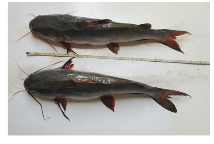
Fig. 3a. Sea catfish (Arius sagor) morphology