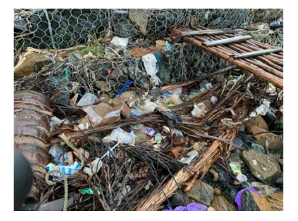
C. Garbage pile