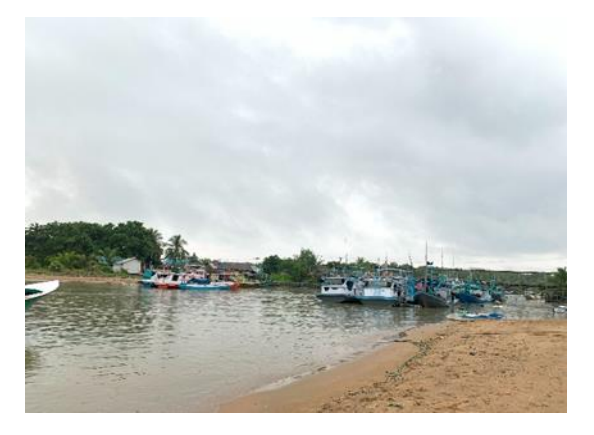
D. Shipping dock

Fig. 2. Utilization of Kuala Tambangan estuary: (A) Fishing boat traffic, (B) Densely populated settlements, (C) Domestic waste, and (D) Shipping dock