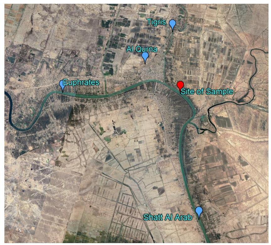
Fig. 1. Site of sample collection

To assess the DNA damage, Oxiselect comet assay kit (Cell Biolabs, USA) was used. The procedure was performed depending on the instructions provided by the producer company. the principle involves mixing the cells sample (hemolymph in this study) with a low melting point agarose, which is then applied on an Oxiselect comet slide covered with regular point agarose. After that, the mixed cells were exposed to a lysis buffer to lyse the cells and remove proteins, cytoplasmic and nucleoplasmic constituents, RNA, and cellular membranes. Then, an alkaline solution was applied on the slides to denature and relax the DNA. Subsequently, slides were electrophoresed to distinguish between the intact DNA and the damaged DNA. Vista green DNA dye was used to stain the samples, which were then visualized under a microscope connected to an image analysis system. The damage in DNA was scored according to Duthie and Collins (1997) .