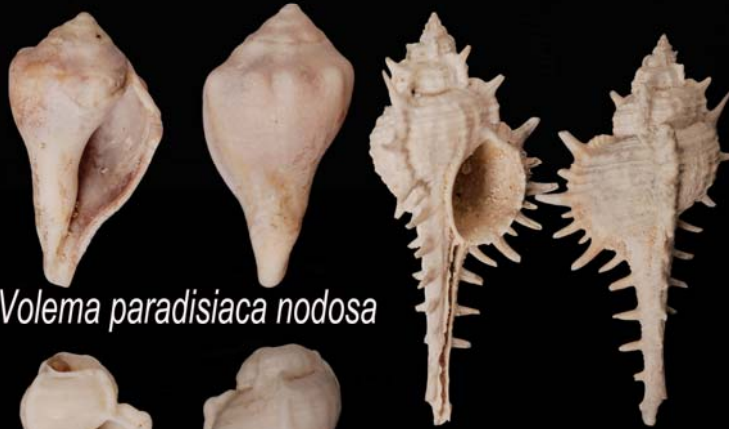
Volema paradisiaca nodosa