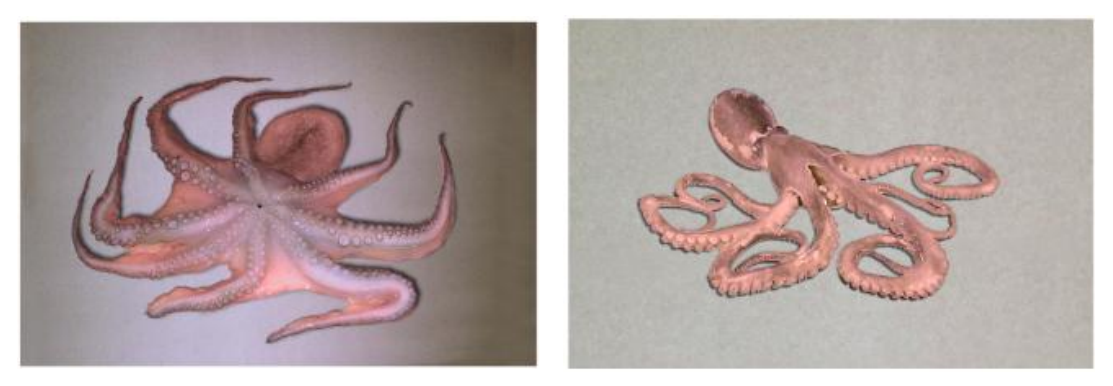
Fig. 2: O. vulgaris